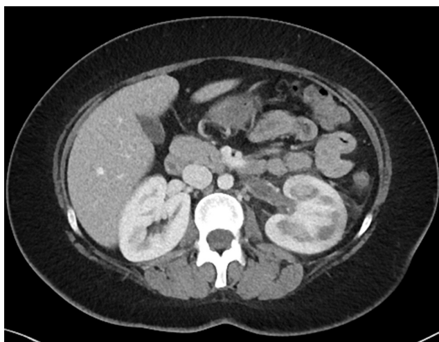
Figure 3. Computed tomographic image from a young woman with a history of human immunodeficiency virus (HIV)-associated nephropathy who developed heavy proteinuria (protein excretion, 11 g/d) at the time of delivery and developed acute left-sided renal vein thrombosis 5 weeks postpartum.

A meta-analysis published in 2015 evaluated both the effect of kidney disease on pregnancy outcomes and the effect of pregnancy on kidney outcomes. The authors reviewed 23 observational studies, which included data for 506,340 pregnancies in women with